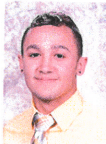
Volunteer Assistant Coach